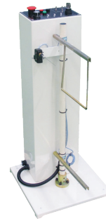
RM Loop Stand